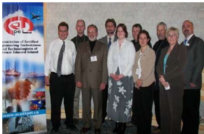
ACETTPEI Council 2006 (left to right)