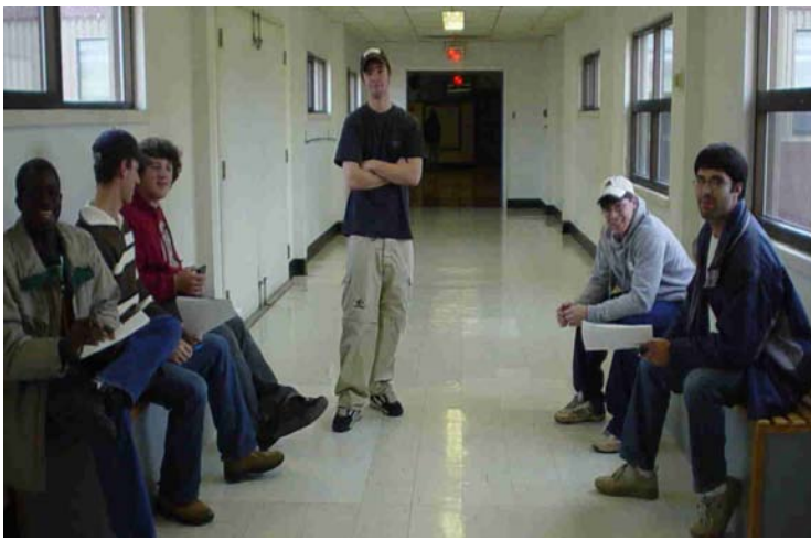
La Semaine nationale de la Technologie CCNB - Bathurst