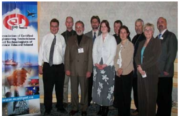
ACETTPEI Council 2006 (left to right)